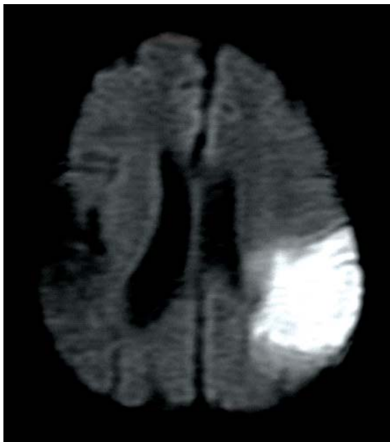
Fig. 1 - Diffusion magnetic resonance imaging of the brain performed after symptoms onset showing recent ischemic lesion in the left middle cerebral artery territory and an old lesion in the right middle cerebral artery region

Diffusion and perfusion MRI obtained on the fourth day before the injection procedure suggested the presence of an ischemic penumbra over part of the left middle cerebral artery territory. Brain single-photon emission computed tomography (SPECT) using Tc-99m showed hypoperfusion in the left parietal and occipital regions (Figure 2A); positron emission tomography with fluorine-18-2-fluoro-2-deoxy-d-glucose (FDG-PET) showed a hypometabolic area within the left parietal lobe and part of the right parietal and occipital lobes (Figure 3A). EEG demonstrated polymorphic delta activity over the left temporal lobe, and TCD revealed normal blood flow velocity in the left MCA.